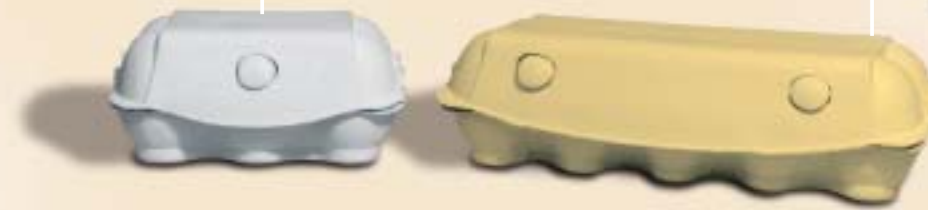
unbeatable in the 10-pack